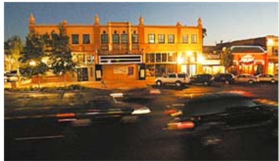
The historic North Park Theatre restoration is nearly finished. The Lyric Opera San Diego, the managing tenant, plans a dedication Sept. 30.

"I'm trying to prove that you can go home again," he said.